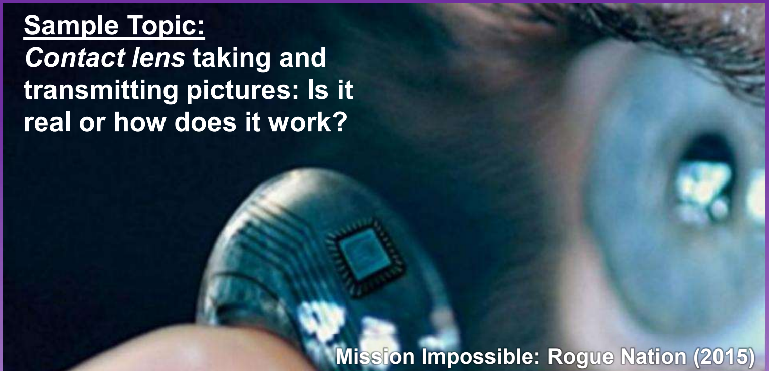
Mission Impossible: Rogue Nation (2015)

Contact lens taking and transmitting pictures: Is it real or how does it work?