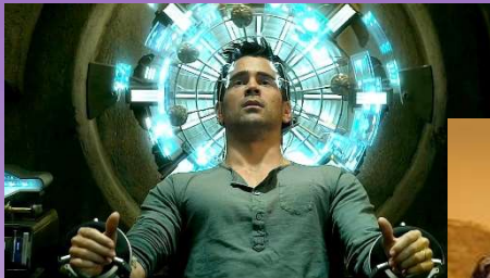
Total Recall (1996 & 2012)