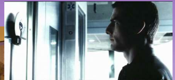
Minority Report (2002)

This course is designed to introduce students basic and relevant knowledge on selected technologies and technical gadgets described in films. A brief history and examples of modern technologies, such as electronics, microtechnology, and nanotechnology, will be concisely introduced. Principles and reality of selected technologies described in films will be reviewed and discussed including wearable electronics, telecommunication tools, robotic devices, and so on. Students are expected to discuss limitations and challenges of technologies shown in films. Throughout the course, students will gain knowledge on contemporary issues and prospects in electronics, microtechnology, and nanotechnology.