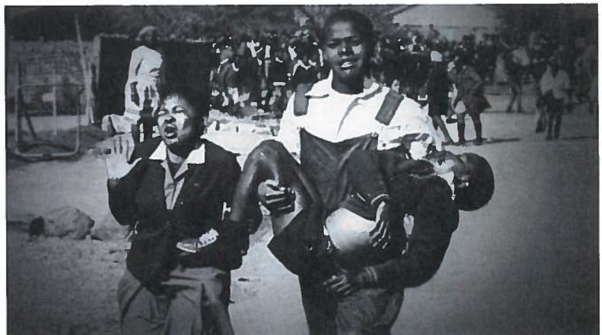
Hector Peterson—Soweto Uprising