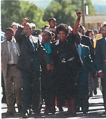
Mandela's Release From Prison