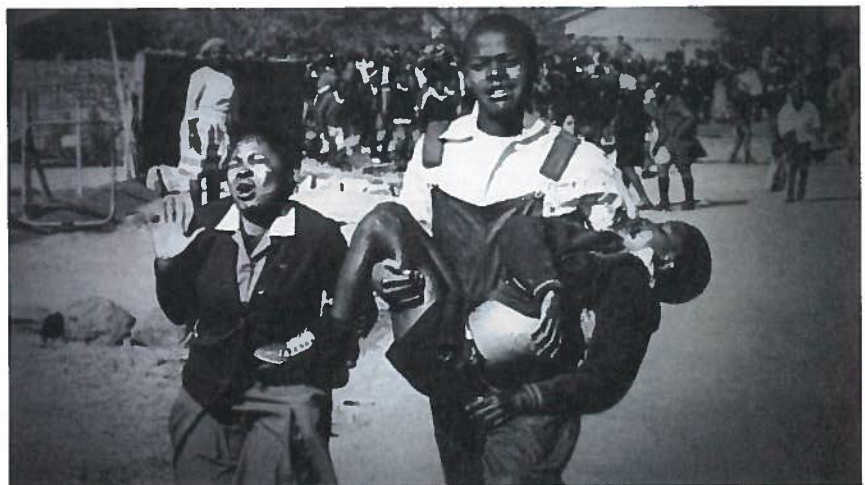
Hector Peterson—Soweto Uprising