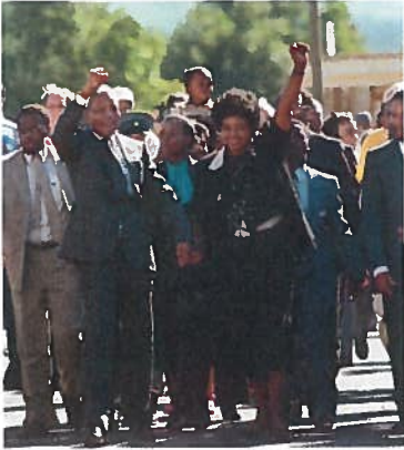
Mandela's Release From Prison