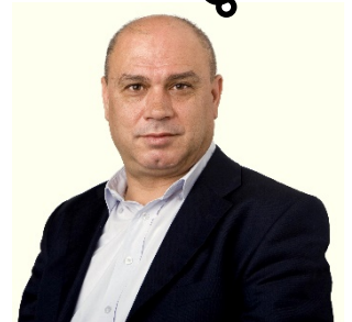
Issawi Frej, Arab MK, Meretz party And Minister of Regional Cooperation