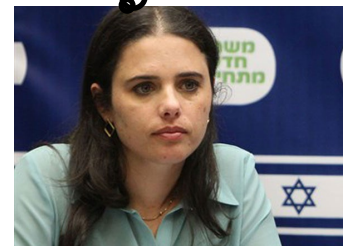
Ayelet Shaked, MK & Minister of the Interior